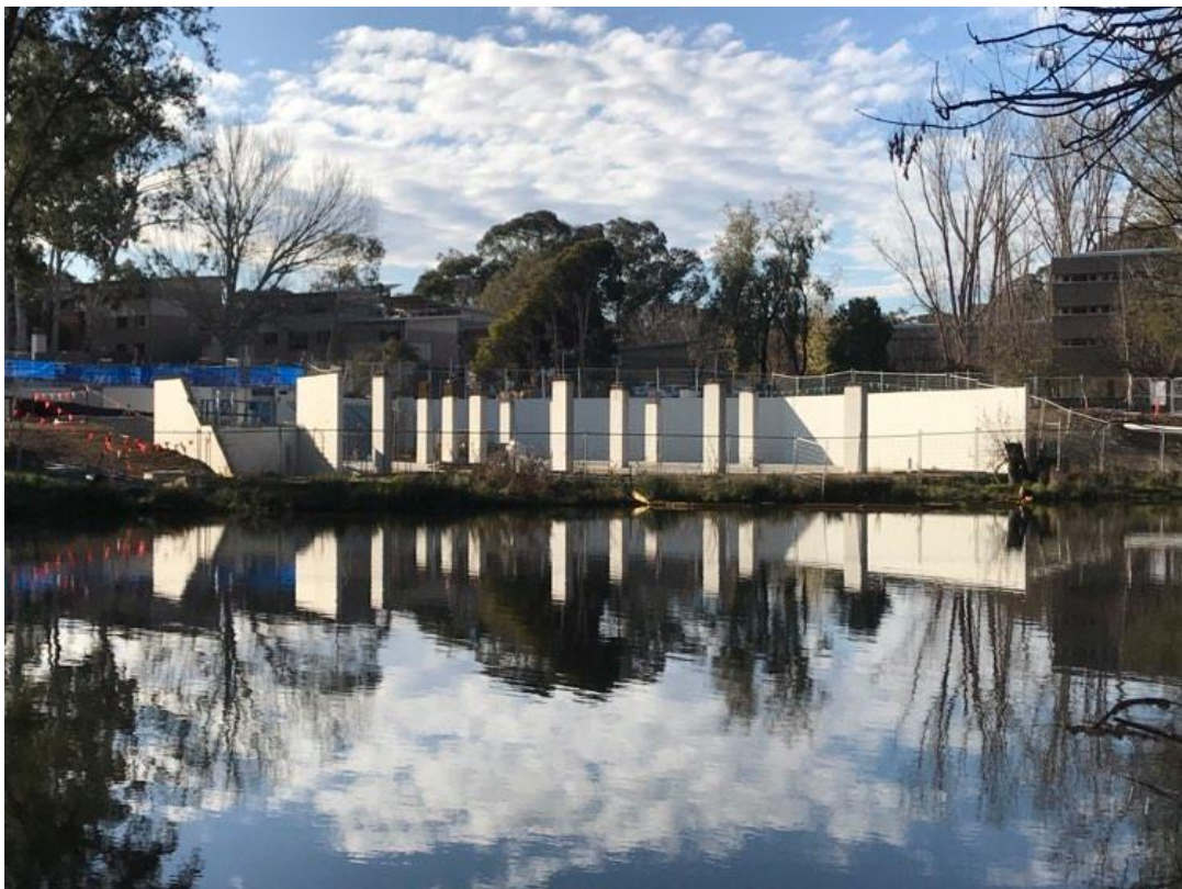
The boathouse that almost was...

While this is disappointing, it also opens the opportunity to build an even better facility sometime in the future. ANU Sport has also begun discussions with the club about what can be done to improve the existing shed, as we might now be there for some time yet.