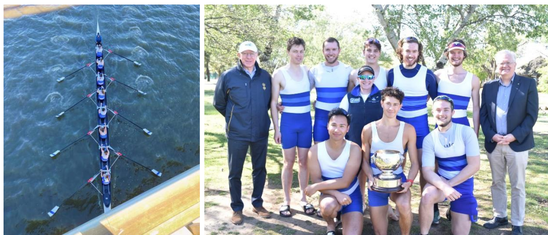
ANU's successful Disher Women's Eight (left) and Men's Eight (right)