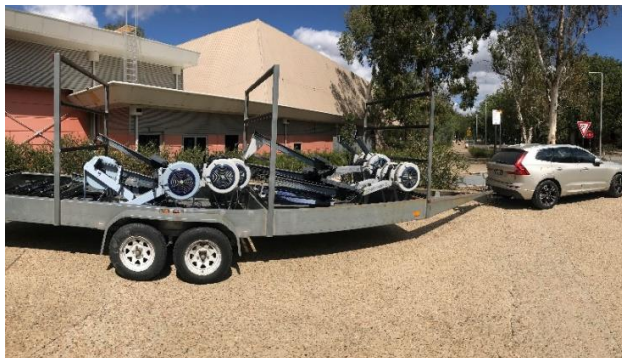
The ANUBC erg home delivery service

In the meantime, with some very welcome help from Rowing ACT and ANU Sport, the committee got to work on developing a COVID-safe Return-to Play Plan, to be ready for the day when restrictions would be eased. Consequently, when the restrictions on sporting activity eventually eased rowing was the first ANU sport to recommence activity. And what a first morning back on the water it was, with nature turning on one of its spectacular early morning light shows to welcome us back.