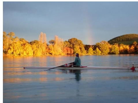
The first morning back on the water